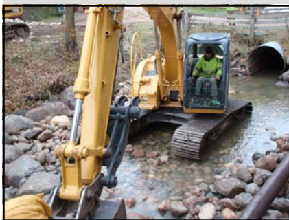
Contractor works the fish passage project on the White Earth Reservation.

A fish passage structure was installed below the dam at connecting Many Point Lake to Little Bemidji Lake on the White Earth Reservation. This project was a fantastic Partnership between the White Earth Natural Resources Department and the Fish and