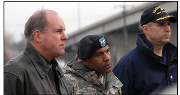
Incident Commanders ready themselves for attack.