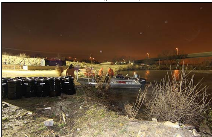
One of the deployed squads, mount up for attack with several of their assigned weapons (black barrels of rotenone).

heightened alert to absorb a host of unusual sights, sounds, smells, tastes, and feelings that rapidly flowed through my consciousness like a rushing stream as I tried to make rational sense of it all: wait in line; register; mobilize; demobilize; credentials; security; checkpoints; briefings; respirator training; cold feet; diesel generators; floodlights; mud; suffocating fish; delays; hazards; pallets of rotenone and sodium permanganate; incident command center; flashing lights; international allies; rotamine-dyed water; sirens; cold hands; first responders; hissing steam; barrels of dead fish; cranes; hard hats; fatigue; dripping nose; underwater obstructions; refineries; trains; photographers; reporters; blood; slime; decontamination; malfunctioning equipment; Red Cross volunteers; hot coffee; port a potties; mountains of coal; windburn; conservation police; helicopters; pumps; search; recovery.